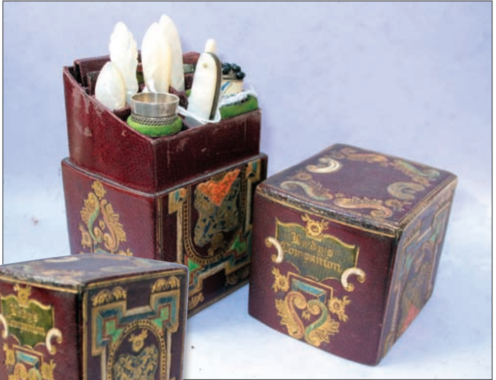
107. 'Ladies Companion' c.1870. Approx 5ins-10cms high. Dark red tooled leather, polychrome colours. Containing a silver thimble, mother-of-pearl pen knife [working] Original mirror [cracked] mother-of-pearl tools, stillieto, corkscrew, tweezers, button hook. back pad with bodkin and scissors.