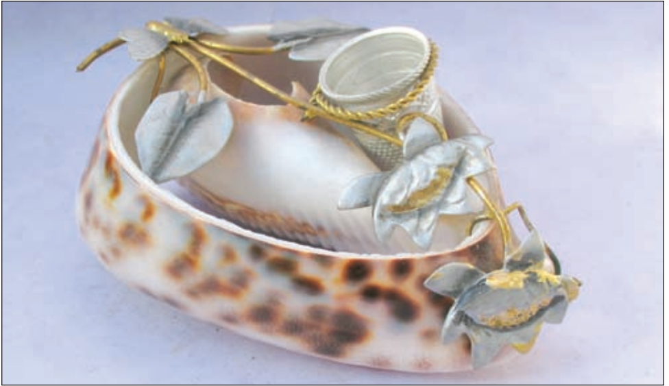
108. Shell thimble holder. Approx 3ins-6cms long. 'Bournemouth' written inside the shell. An aluminium thimble inside a pretty metal leaf shaped holder. English, c.1920.