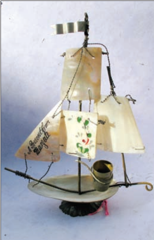
109. A ship thimble holder. approx 7ins-13cms high. 'A present from Margate' on this decorative thimble holder c.1920. A delightful ship in full sail, the sails made from mother-of-pearl, as is the shell boat.